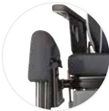
Integrated 50 mm leg abduction