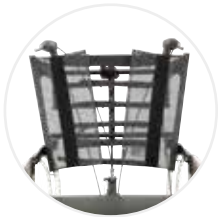
Adjustable back straps for optimum fit and the possibility to fit the back tubes to different torso shapes.

A large selection of accessories ensures optimum adaptation to the user's needs.