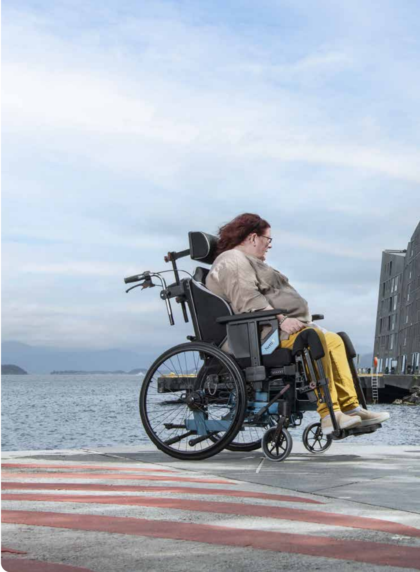
Netti V in its "home environment", Stavanger, Norway.