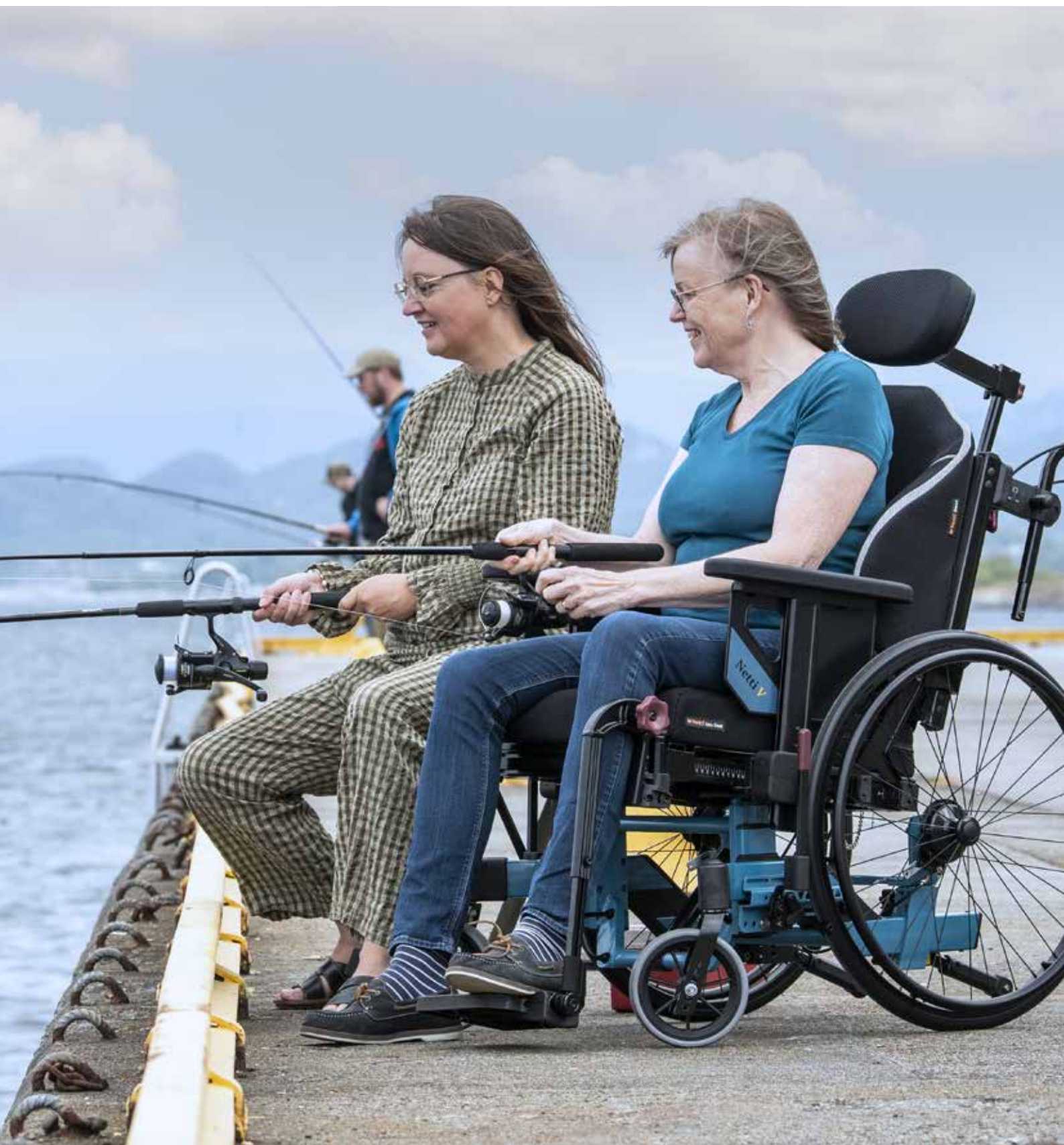
Customising the centre of gravity and wheel position ensures a good manoeuvrability.