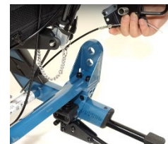
Adjustment of 30 mm changing the wheel position