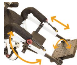
Dynamic leg supports