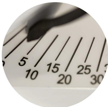
EASY HANDLING OF TILT WITH READABLE ADJUSTMENT